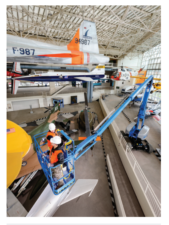
Low Noise, Low Emissions